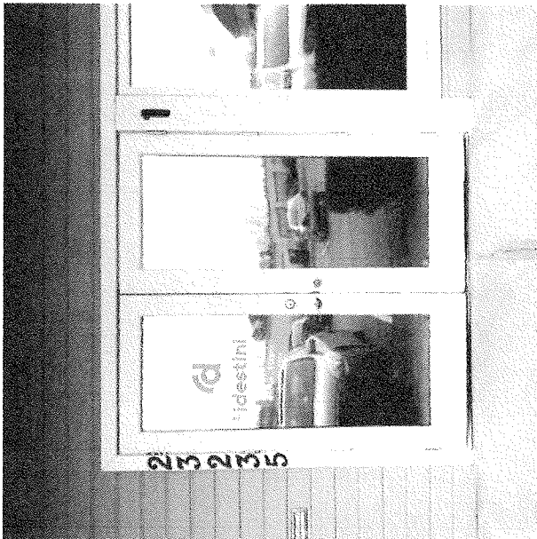
2/c vinyl door graphics

idestini 23235 I-30 Suite 1 Bryant, AR 72022