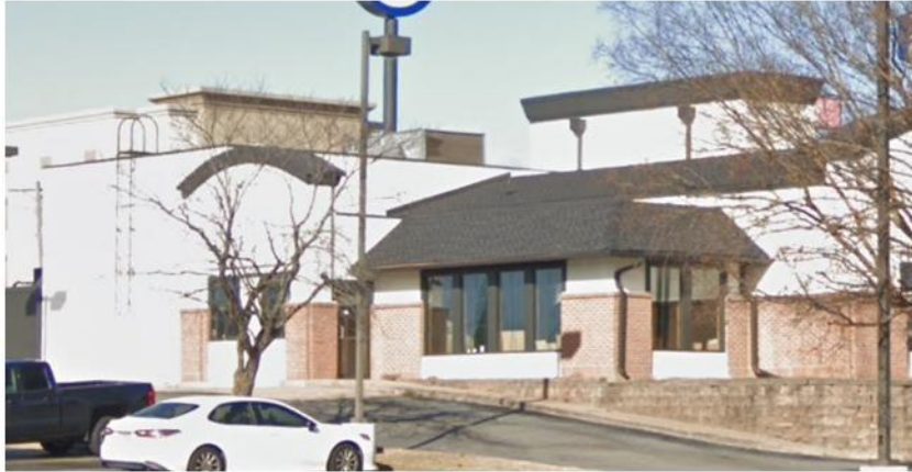
SOUTH ELEVATION 20' X 85'