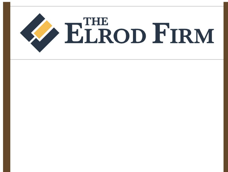
H1'-3" x W5' panel with applied graphics (2) H4' posts