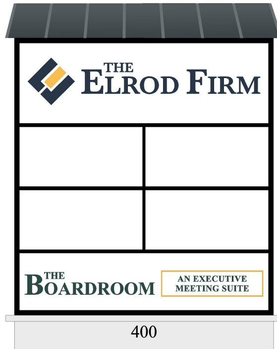
H10' x W8' custom monument