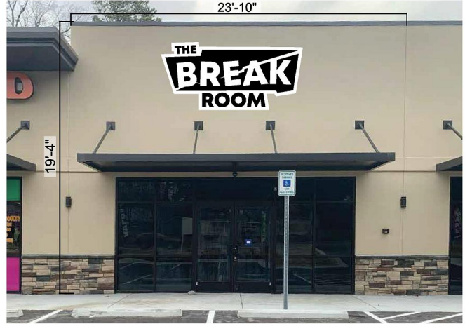
RENDERINGS NOT TO SCALE